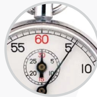
RANDOM MARKETS OPEN 24/7